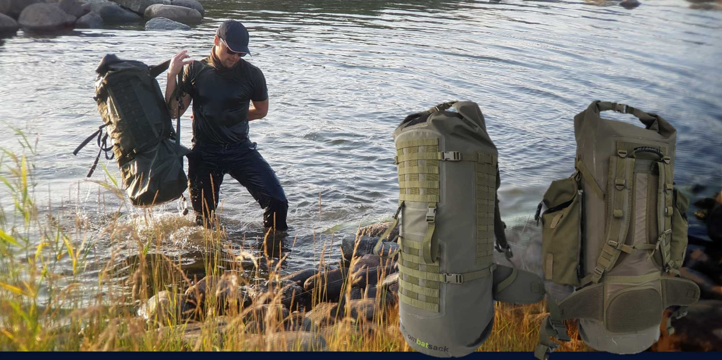
rescue work • military activities • hiking • sailing • kayaking • fishing • hunting • motorcycling